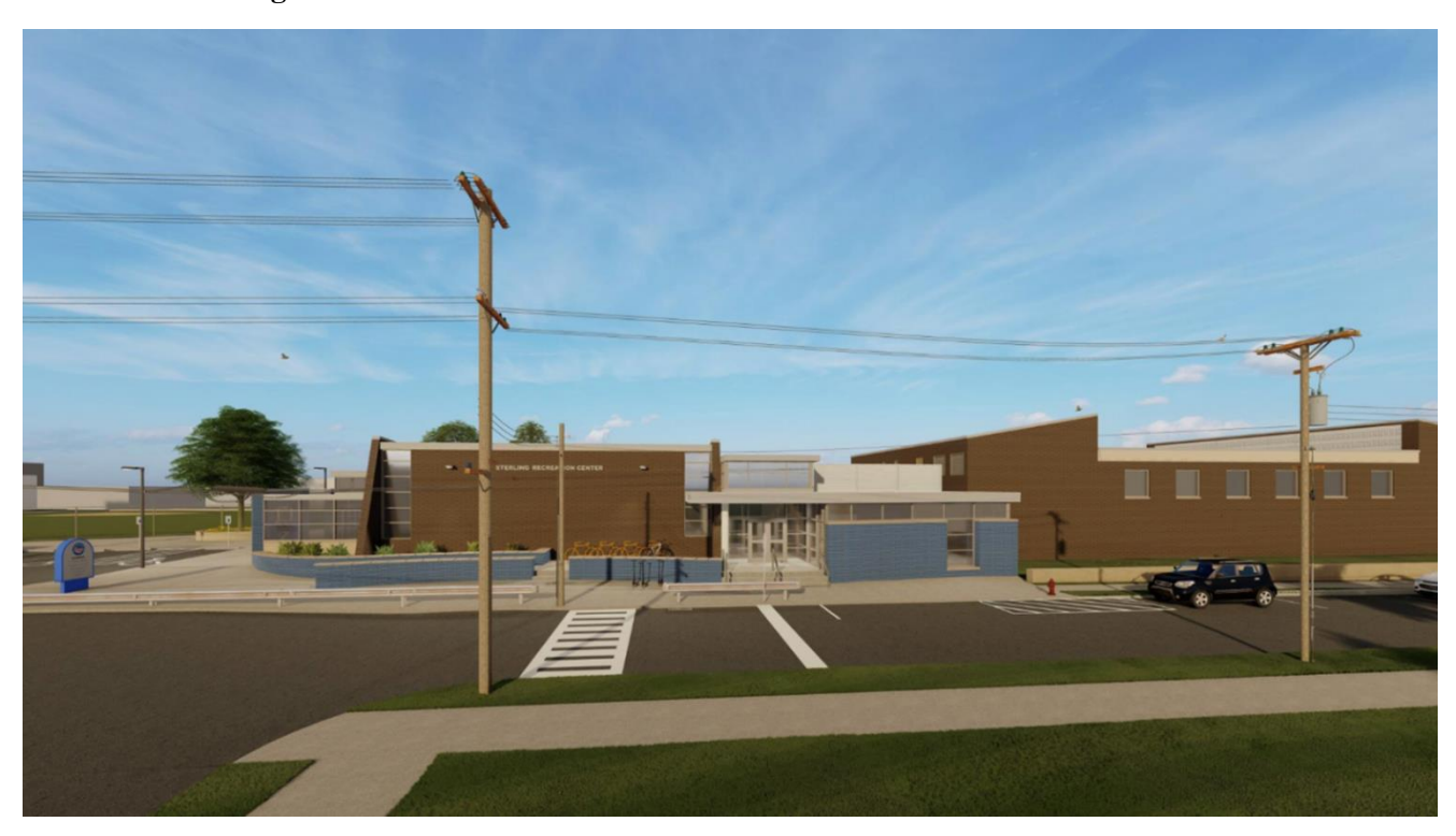
Exterior Rendering 2 - Front and Side View from Southeast