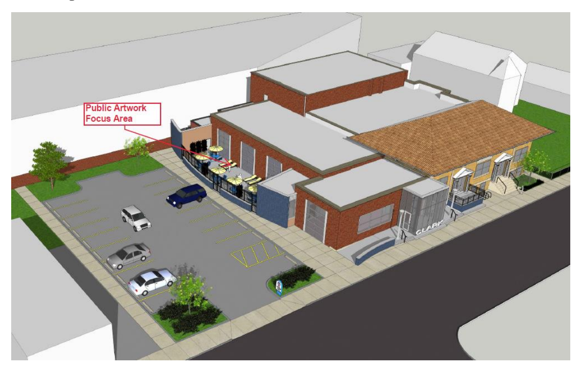
Rendering 4 - Overall View of the Renovated Clark Recreation Center