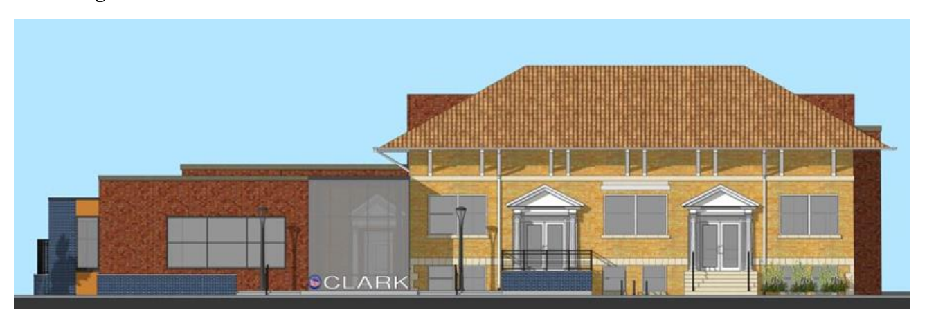
Rendering 2 - Another Front View